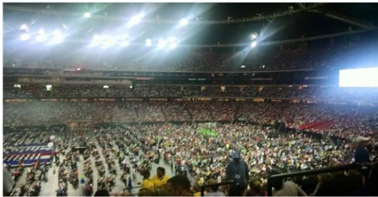
EST 325,000 FAMILY AND FRIENDS OF PROBLEM DRINKERS